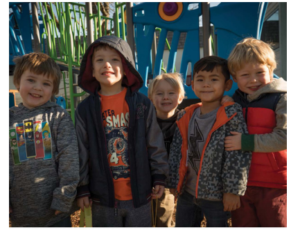
AWARENESS AND THE USE OF PARKS

GP RED conducted a research project for the National Recreation and Park Association (NRPA) under contract in 2018 to look at exploring how the aspects of proximity to and awareness of parks and recreation components are perceived, and how they potentially affect of our community Park and Recreation Systems. The research included a comprehensive literature review, aggregated survey and data analysis from 119 communities around the country. In addition, the work explored both objective proximity (actual measured distances from ones home to a park); perceptions of proximity (how far they think they are from a park), along with awareness of availability (do they know or can they find out where the parks and facilities are. Recommendations were included for how public agencies can address these factors going forward.